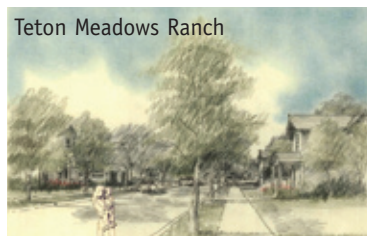
Teton Meadows Ranch

Story Mill Neighborhood, Bozeman, MT — Story Mill Neighborhood is a mixed-use urban infill project and LEED-ND pilot consisting of 1,200 dwelling units on 106 acres within the Bozeman city limits.