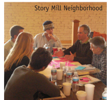
Story Mill Neighborhood

Teton Meadows Ranch, Jackson, WY — Teton Meadows Ranch is a proposed 500-unit subdivision on 288 acres five miles south of Jackson in Teton County. It features affordable and GAP housing with appreciation limits intended to attract low- and middle-income residents.