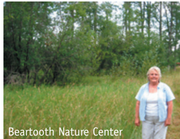
Beartooth Nature Center

Beartooth Nature Center, Red Lodge, MT — The nonprofit Beartooth Nature Center is piloting its new facility, which will include a Visitor's Center, education building, offices, quarantine facility, restrooms and observation points, wetlands boardwalk, water features, an aviary, and a barn on 20 acres of land five miles north of Red Lodge.