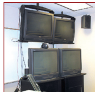
Workshop participants at six different sites met face to face using video conference technology.